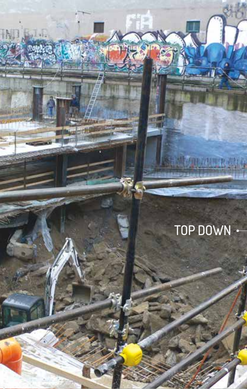
TOP DOWN •

FRATUS RESTAURI recently applied with great results in the realization of TOP DOWN structures, that means multi-story underground structures built from top to bottom instead the traditional way from bottom to top.