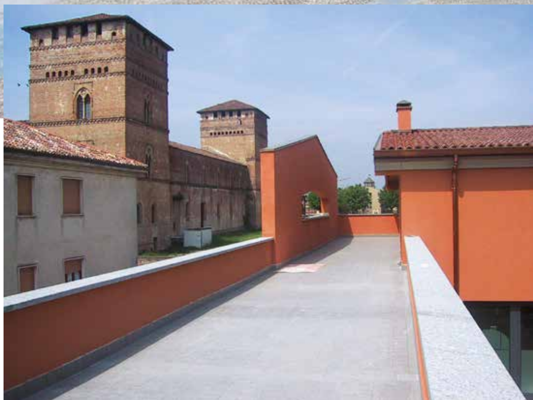
RESIDENTIAL CENTER 2000