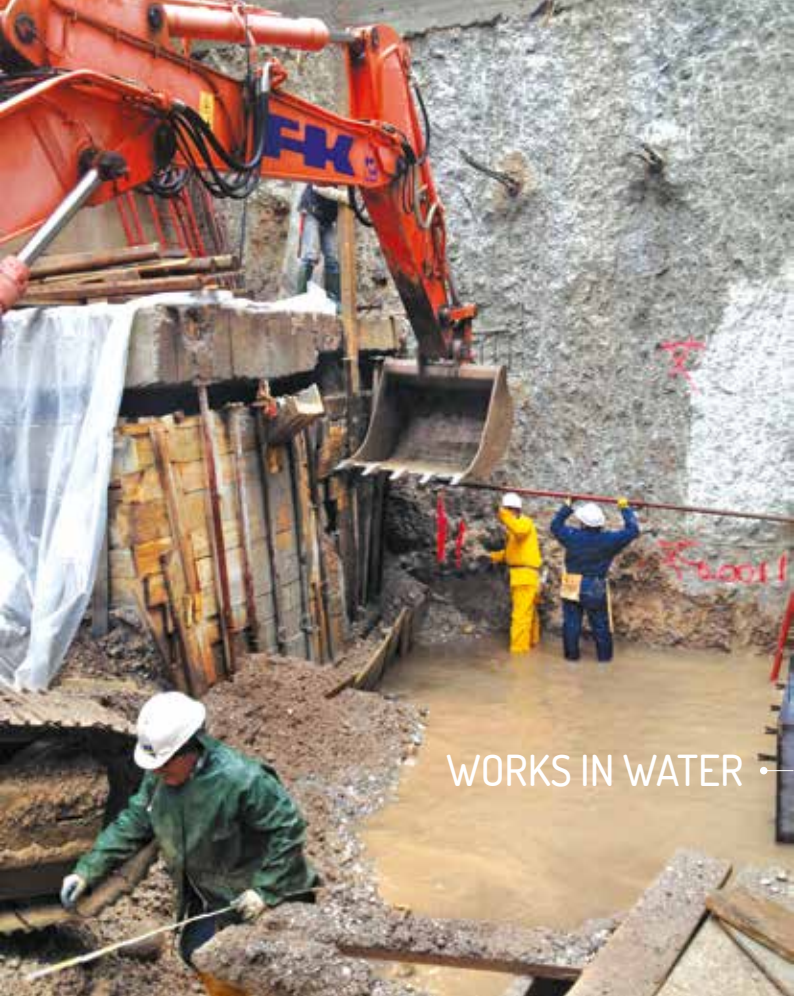
WORKS IN WATER •

At FRATUS RESTAURI, we realized structures under water, near the edges of lakes or rivers; we're competent and highly qualified for the use of pump nets, well systems, canalizations and 24-7 systems to manage WORKS IN WATER.